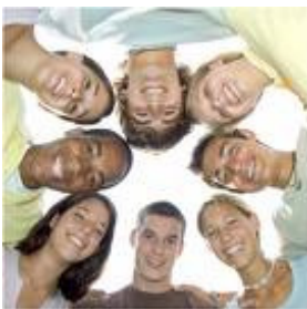
Circles of friends has a whole new meaning!

This bibliography includes works on surviving the pressures of adolescence including relational aggression, information specific to girls and boys, as well as general background information.